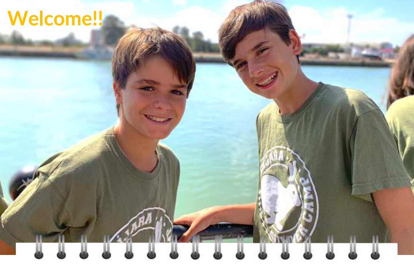
Get the most from this Summer with an enjoyable and fun-filled